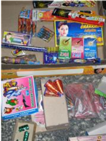
Photo Gallery of Deepavali celebrations at Sri Ramanasramam on 8 th November 2007