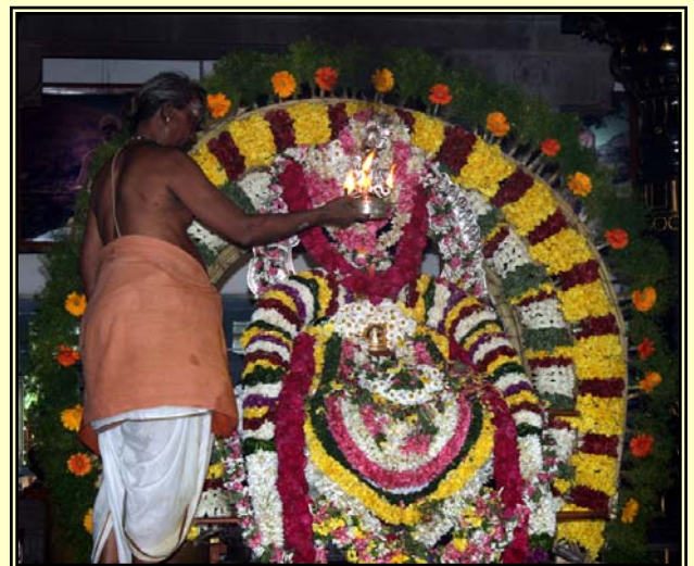
Sri Bhagavan's Shrine on Jayanti Day

It is said that he who understands the ten verses of the Mandukya Upanishad has no need to study the other Upanishads because they show the world to be a state of the mind, just like the other two states, and also because what it leaves unsaid but inferred is as important as what it says. From its representing the three states as the only states through which the jiva passes in its apparent peregrination we have to conclude that death introduces no new state for the ordinary man but only retains what he now experiences, namely the conditions of dream and sleep or alternation of the two, till rebirth in a new body take place and restores the waking state also. The same applies to loss of consciousness due to drugs, anesthetics, fainting fits or the laya of hatha yoga , misnamed samadhi . But the Sage is above all three states both in this life and after death, being established permanently in Turiya , the Fourth, which is pure Consciousness, the nature of the Self, and from which there is no return to a body. He has freed himself from the pangs of birth and death for ever. Such a one was Bhagavan Sri Ramana.